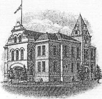
1909 SUMMIT COUNTY COURT HOUSE